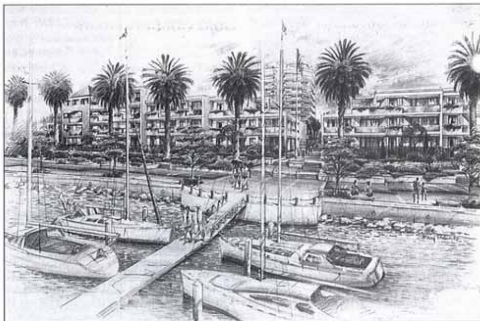
Bridgewater Quays Units, Kangaroo Point, Brisbane, Queensland