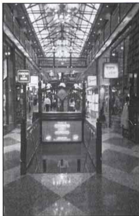
Brisbane Arcade Refurbishment, Adelaide & Queen Street, Brisbane

WALKER Corporation is presently completing a major development on the east side of the Story Bridge at Kangaroo Point.