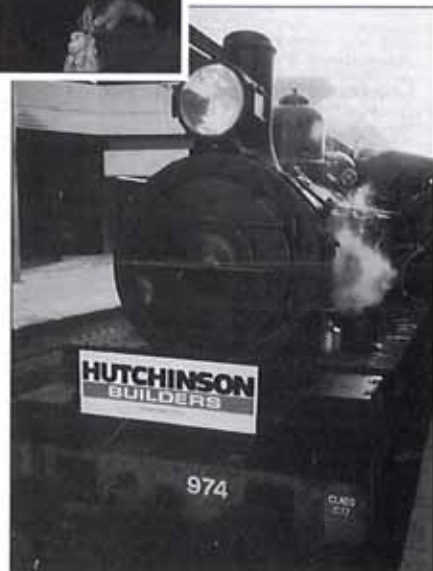
RIGHT: Hutchies made no secret about taking over a steam train for their social outing.