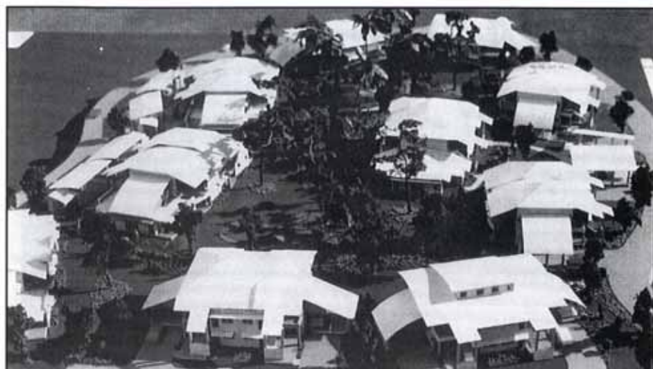
Marlin Cove Unit Development, Trinity Beach, Cairns, North Queensland